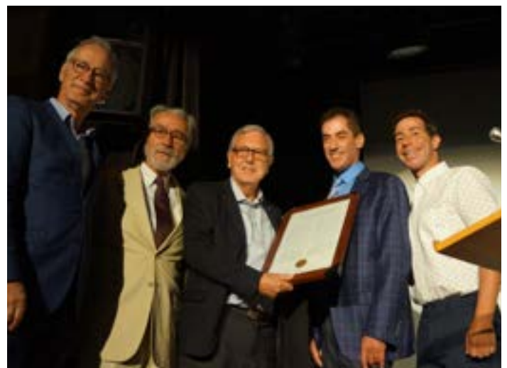
250th Anniversary of the Spanish and Portuguese Synagogue