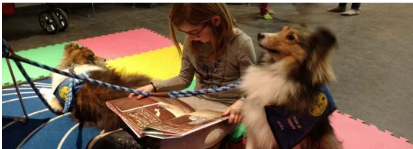
Furry Paws Reading Club