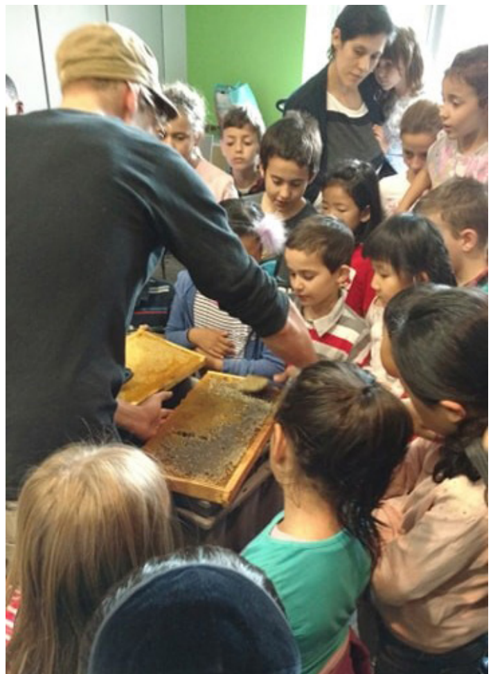
Honey Making Workshop with Alvéole

The Lego Wall went up at the beginning of June and has been a popular addition to the Youth Department. Lego promotes physical and mechanical skills thus encouraging STEM (Science Technology Engineering Mathematics) skills.