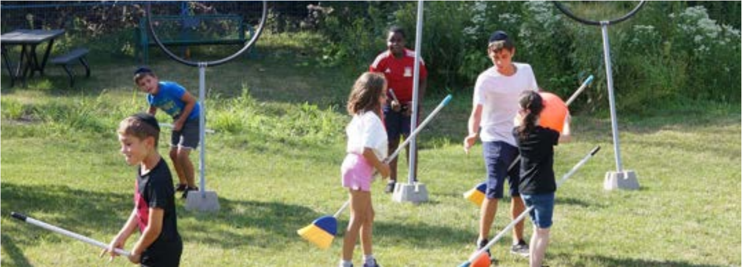
Harry Potter Birthday Party