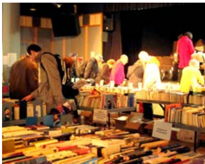
Library book sale

On April 21 and April 22 the library held the first of our semi-annual book sale. In total we had 21 volunteers who donated a total of 116 volunteer hours over the 5 days. The sale was a success as we raised a total of $2,541.85. The second sale took place on October 20 and 21 and raised almost $3,300. The money raised goes to fund "love to have" projects such as the iPad kiosk.