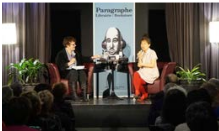
An Evening with Kim Thúy