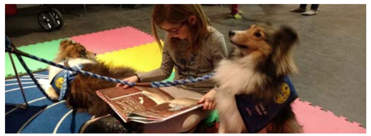
Furry Paws Reading Club