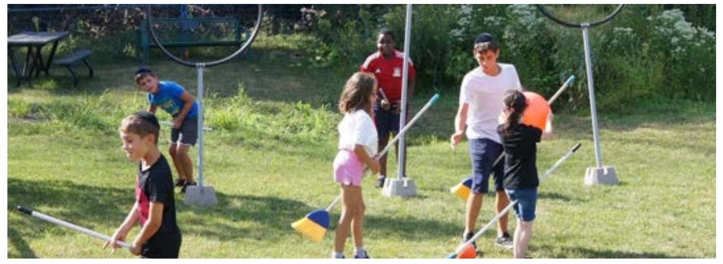
Harry Potter Birthday Party