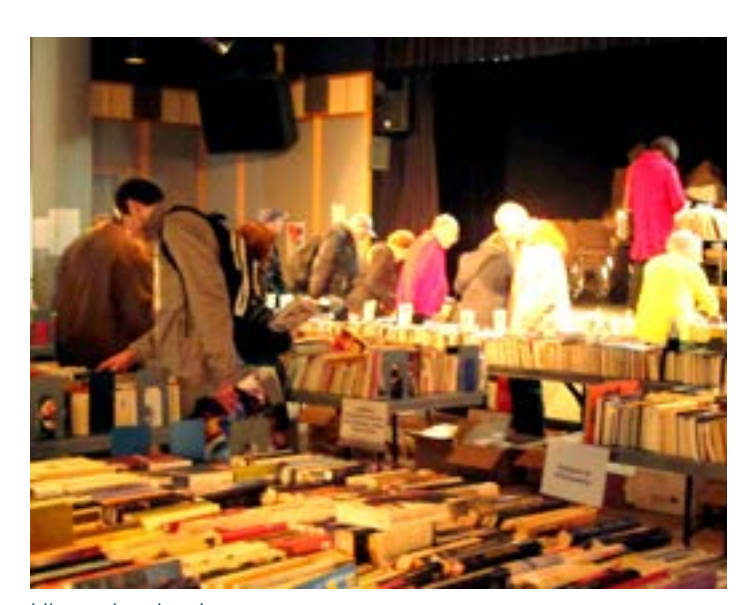
Library book sale

Home Library Service was extended in 2018. Currently there are 311 HLS patrons being served by 8 regular drivers and 2 back up drivers.