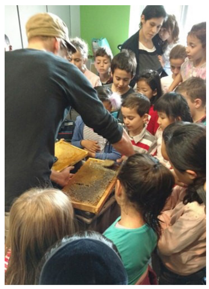
Honey Making Workshop with Alvéole

The Lego Wall went up at the beginning of June and has been a popular addition to the Youth Department. Lego promotes physical and mechanical skills thus encouraging STEM (Science Technology Engineering Mathematics) skills.